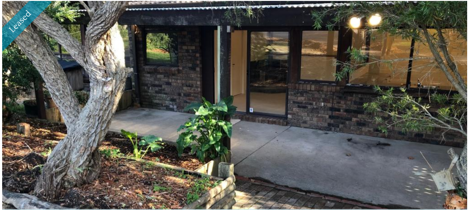
Lot A & Lot B, 44 Myoora Rd, Terrey Hills