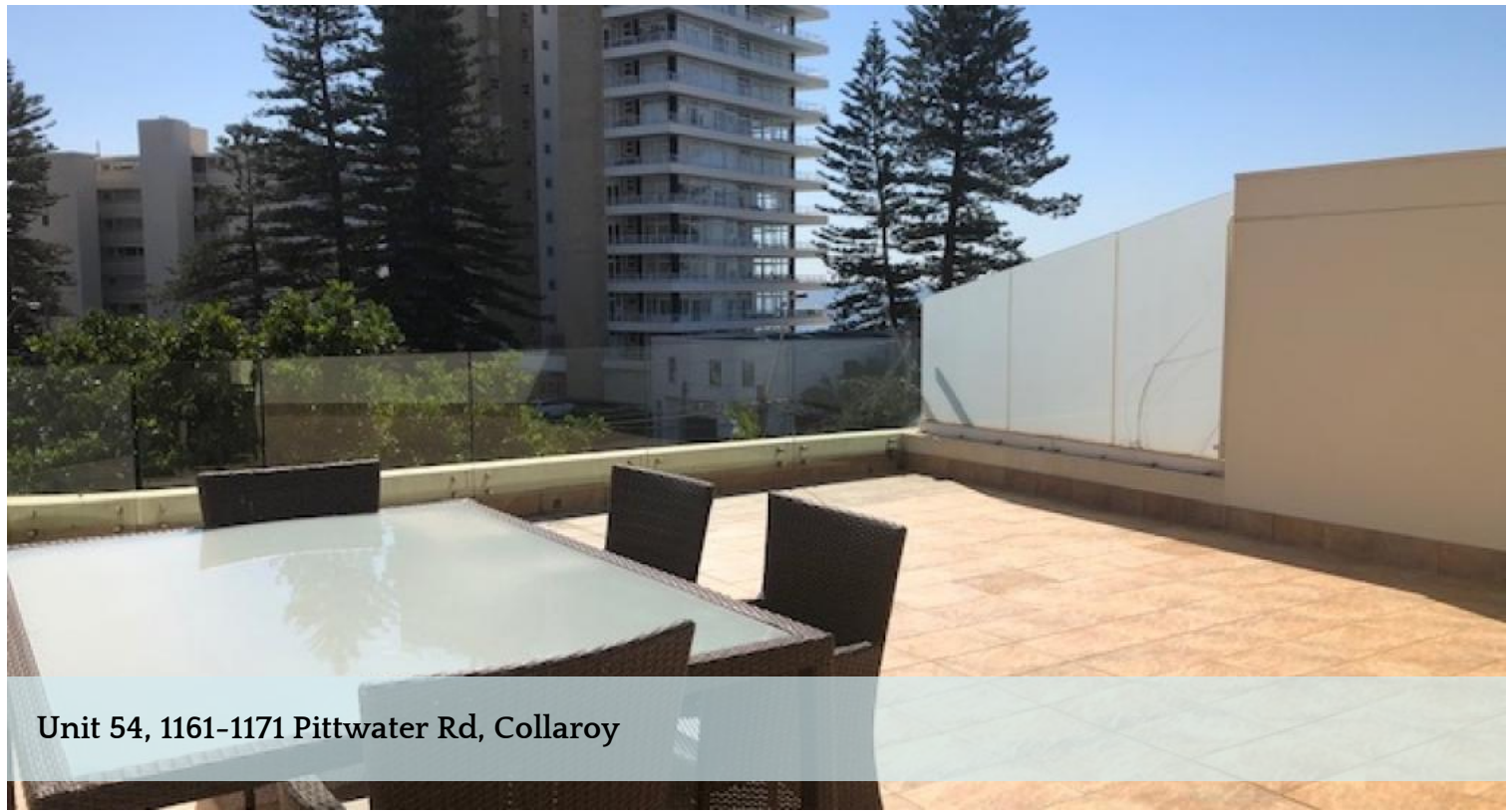
Unit 54, 1161-1171 Pittwater Rd, Collaroy